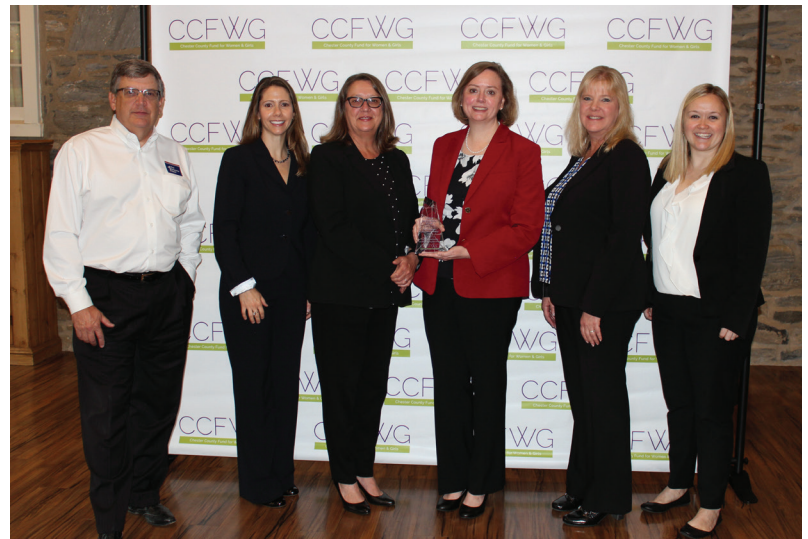
We were delighted to receive Corporate Champion of Change Award from the Chester County Fund for Women and Girls.

Visit Us in Exton, Wayne or West Chester Today!