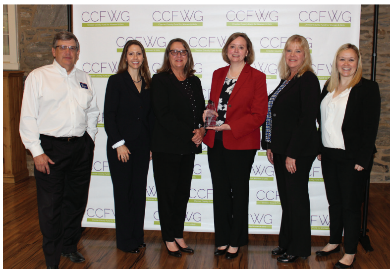
We were delighted to receive Corporate Champion of Change Award from the Chester County Fund for Women and Girls.

Visit Us in Exton, Wayne or West Chester Today!