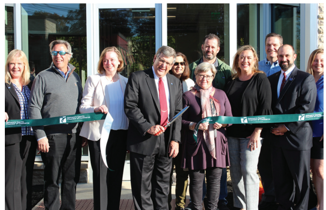
It's official, our Wayne branch is open. We were proud to celebrate the event on October 15 with a ribbon cutting ceremony and tours of the new facility.