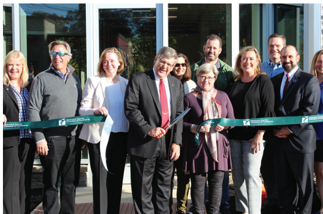
It's official, our Wayne branch is open. We were proud to celebrate the event on October 15 with a ribbon cutting ceremony and tours of the new facility.